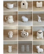
(Examples of items to paint)

If your little one can keep the paint out of their mouth, they can paint pottery! In our experience, any younger than 2 years old gets tricky. Our studio is family-friendly, including a kids' room with toys and TV, a rocking chair, a high chair, and changing table, which are all available for those who need them!